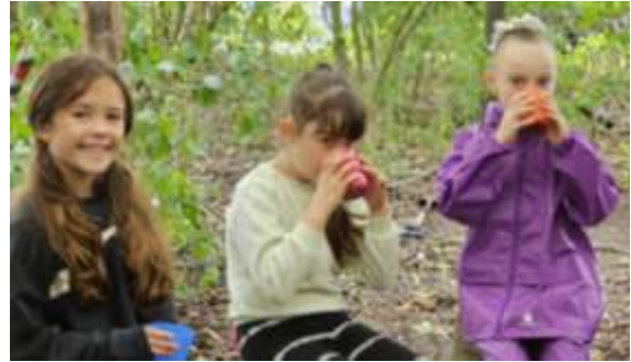
We enjoyed the scrumptious hot chocolate and a biscuit!