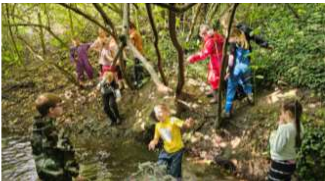
We all had a great time!